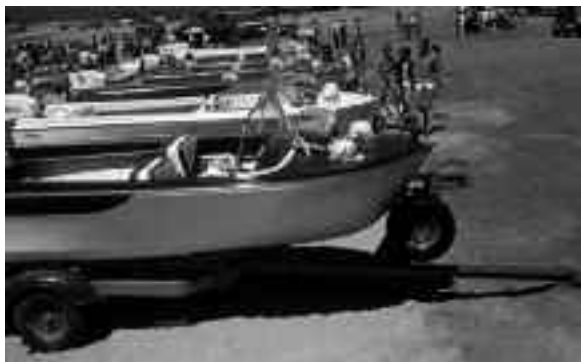
The Coast Guard Cee Gee boats