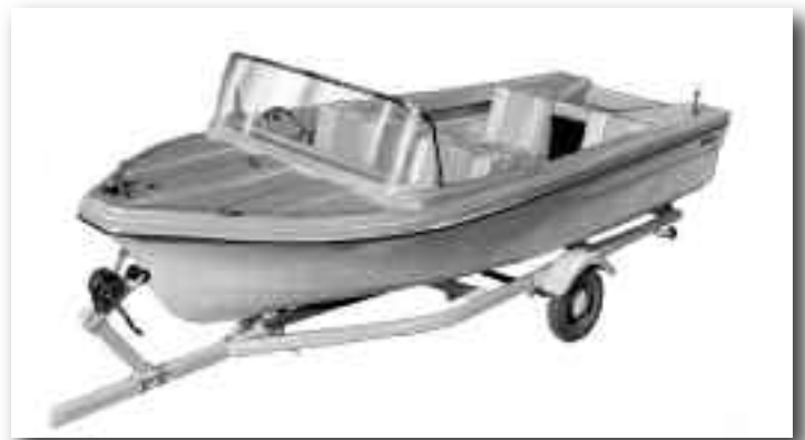
Wescraft 17' model

Wes did all the selling and set up dealers in Kansas, Nebraska, Colorado, and surrounding areas. Even if a dealer only sold a few boats a year, the boat builder remained loyal to that dealership. The company was an early adopter of metal flake use in the gel coat. The "Fire-Flake" brand by Western Products was their material of choice.