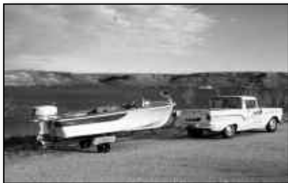
1960 Wescraft with 1957 Ford Ranchero