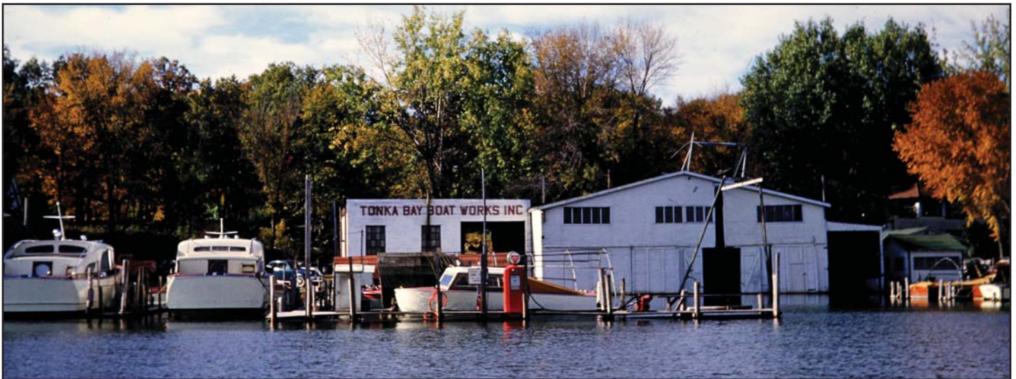
Tonka Bay Boat Works, from the lake. Time to gas up!