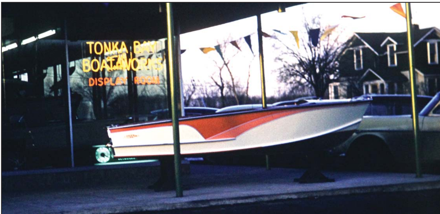
Tonka Bay showroom at Vine Hill Road and Highway 7 with a nice tri-tone Crona Craft out front.