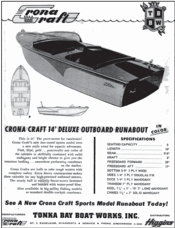
1956 Crona Craft advertising piece.